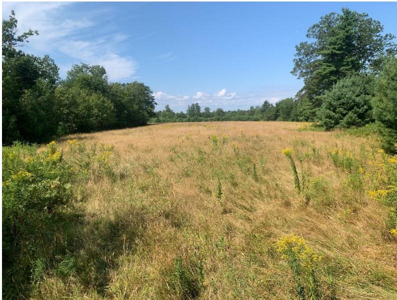
Frost Meadow Farm, 50 ac, Gorham