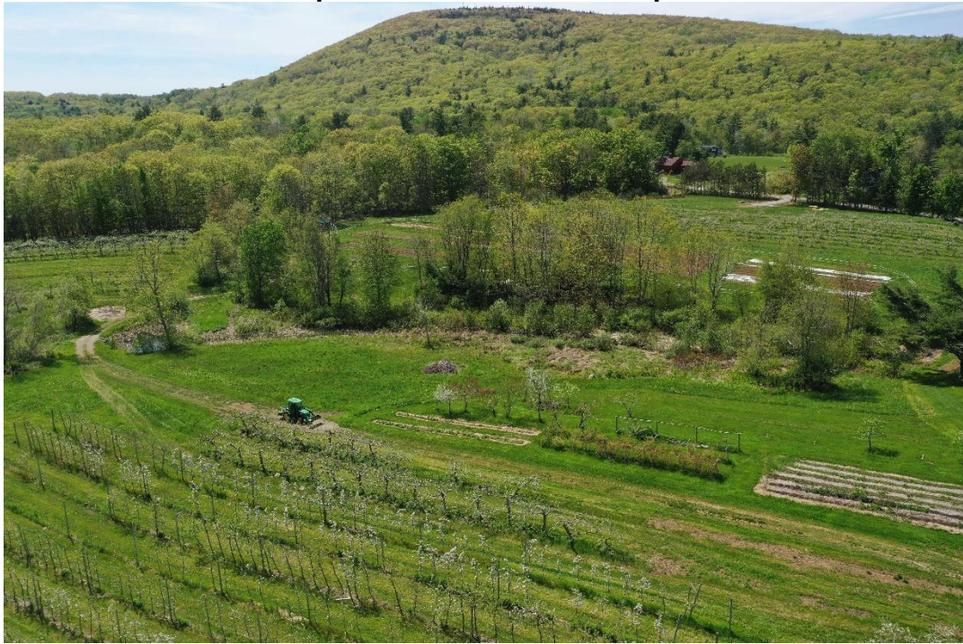
Hope Orchards, 45 ac, Hope