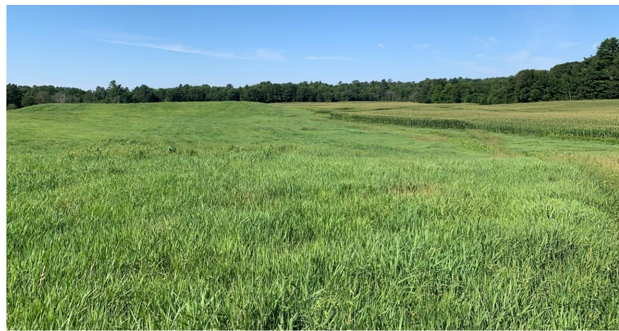
Halledge Farm, 186 ac, Windham